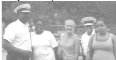
Enjoying KH June Night Out